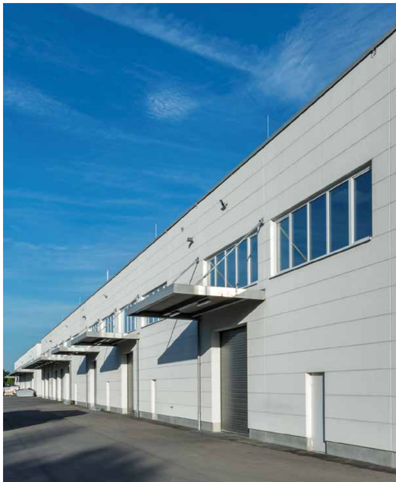
Inner-city business park “Am Nordring” in Munich

The latest amendments to German building legislation have created the basis for an urban development with mixed use