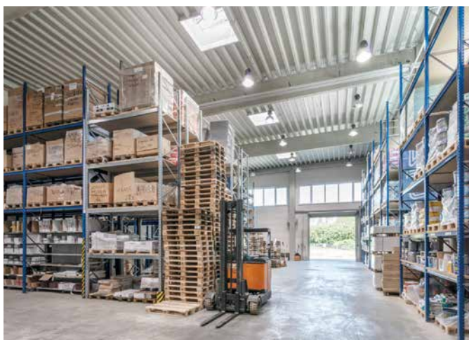
Flex spaces used for storage purposes at the “Am Nordring” business park

quarters, as well as for solutions addressing specific issues, such as moving last-mile logistics facilities (the final delivery leg to the customer) into the city.