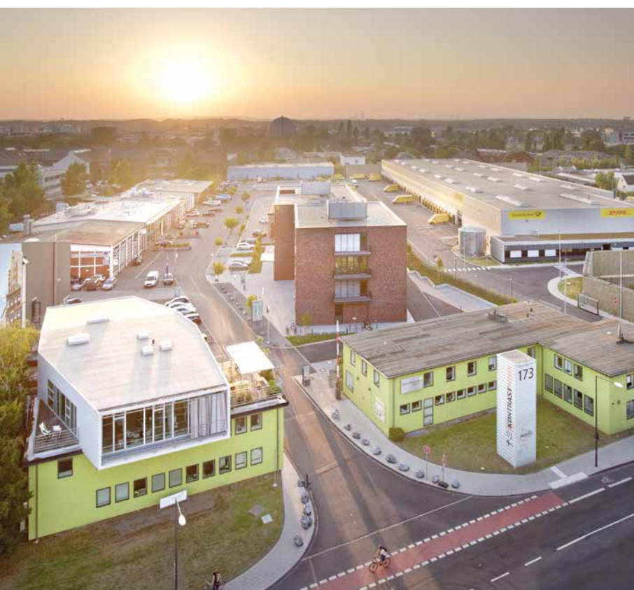
Modern format of a business park, illustrated by the Kontrastwerk complex in Cologne

Creating new housing is a popular thing to do among citizens, municipalities and investors alike. Yet the neat thing about the creation of business parks is that they could simultaneously help to cope with the challenges of city logistics and intra-urban manufacturing. Since the various use types are likely to compete for shares in the new land category, it would be sensible for developers, occupiers and municipalities to engage in dialogue to fully exploit the potential of the new “urban areas.” To this end, it will be of the essence to showcase the added value of use concepts that the creation of business parks will bring for a given city and its residents, and thereby to avoid a mono-track fixation on housing development. Urban living is ultimately all about diversity and needs to take the needs of many different user groups into account to live up to its promise.