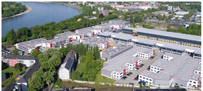
Business Park Düsseldorf Süd